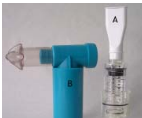
Figure 2 Commercially available pressure threshold inspiratory muscle training devices. A: The Threshold® (Respironics Inc., Murrysville, PA, USA) pressure threshold trainer; B: The POWERbreathe® (Gaiam Ltd, Leamington, UK) pressure threshold trainer.

Due to its flow independence, training using an IPTL can be undertaken effectively without the need to regulate breathing pattern. In addition, IPTL using a device with a mechanical poppet valve is both portable and easy to use, with evidence of efficacy when implemented in a domiciliary setting, as well as with long-term use